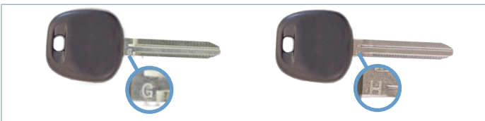
Toyota® G or H keys can be rapidly identified by the letter on the blade

Contact your distributor to purchase ADS199 now.